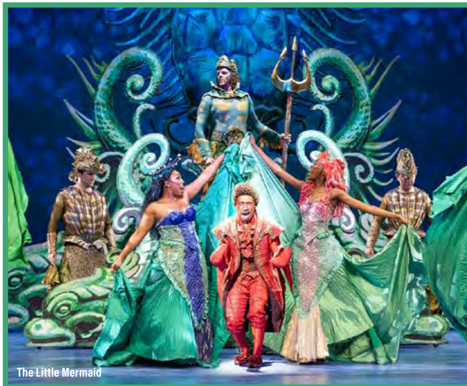
The Little Mermaid

End your holiday season on a high note with this beloved tradition showcases talented young singers in an unforgettable musical experience. Visit landmarkcenter.org/event/sundays-at-landmark-minnesota-boychoir-concert-3 .