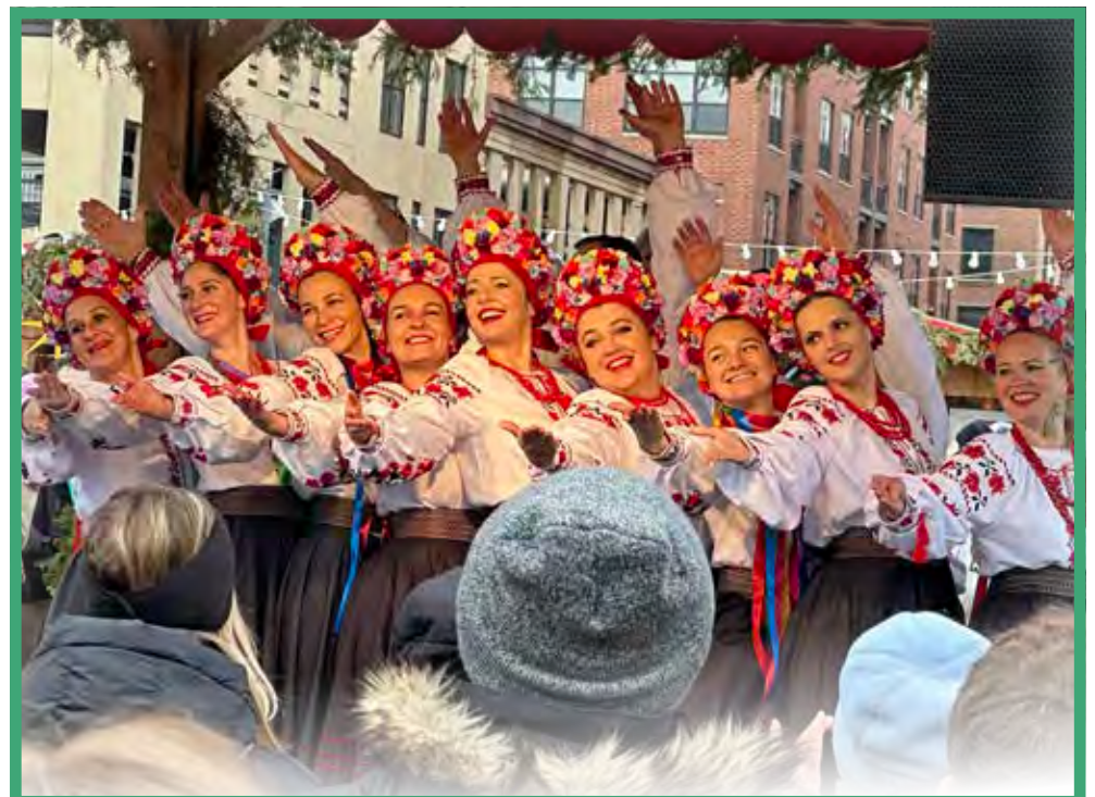
Ukrainian Dance group perform at European Christmas Market.