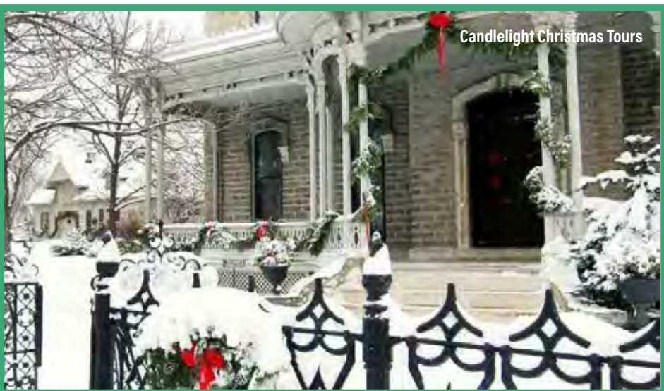
Candlelight Christmas Tours