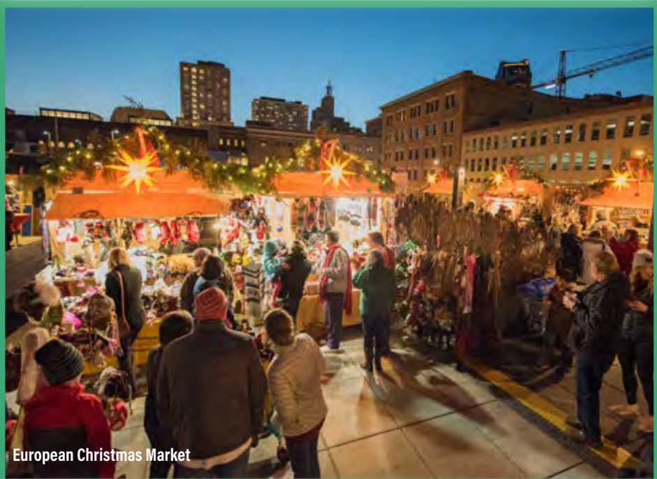
European Christmas Market